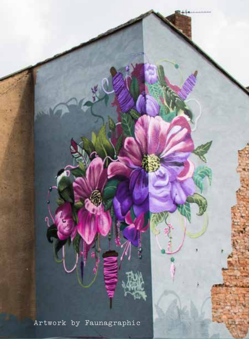
Artwork by Faunagraphic