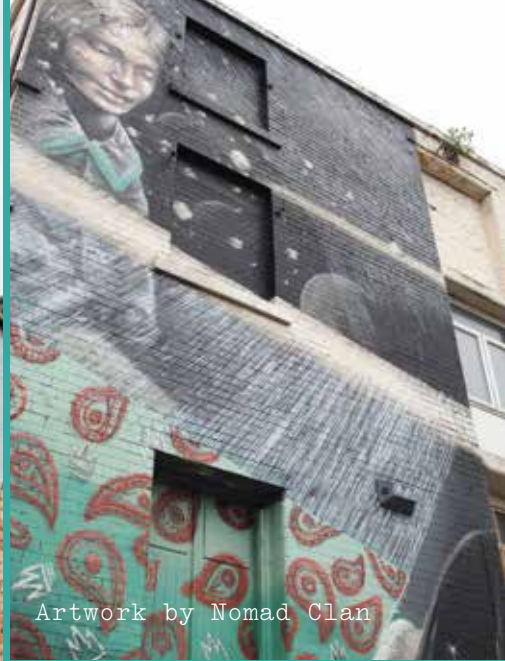
Artwork by Nomad Clan